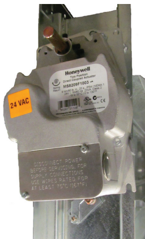
Electric External Mount Actuator

Currently, most control damper applications use electric actuators. They are available in a variety of drive configurations, however, the HVAC industry has standardized direct-coupled models because of the ease of installation and interchangeability. Electric actuators are available with supply voltages of 24 VAC, 24 VDC, 120 VAC, and 240 VAC. Each is designed for single-phase power. A transformer may be used to reduce high voltage systems (277, 460/480, and 575V) to meet actuator voltage.