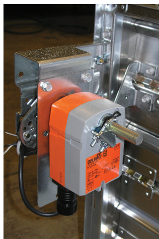
Electric Internal Mount Actuator

Pneumatic actuators are linear output devices that require instrument air (clean and dry air) for actuation and a linkage system to convert their linear motion to the rotary motion required for damper operation. They are provided with spring return operation, which returns the actuator's linear shaft to a fixed position when air pressure is removed. Pneumatic actuators are simple, reliable, and relatively inexpensive.