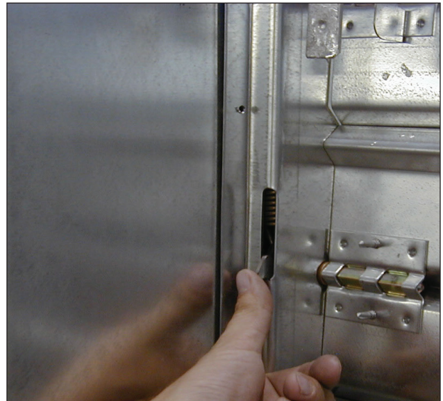
4. Push in lever.