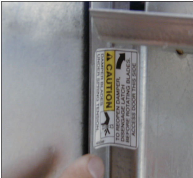
3. Label with instructions on how to open damper.