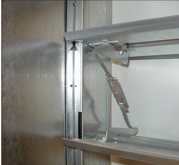
1. Damper in the open position with fusible link attached

These instructions are provided for changing fusible links on DFDTF-210.