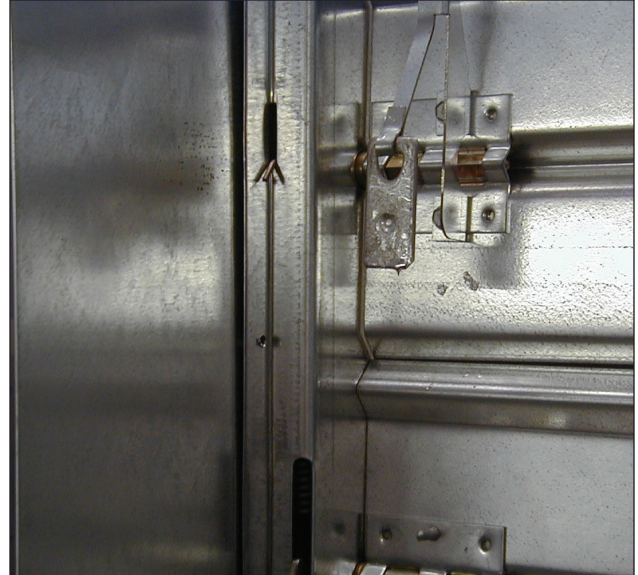
2. Damper in the closed position with melted fusible link. Straighten out upper part of link strap. Remove melted fusible link.