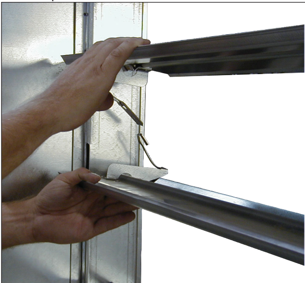
7. Blades fully open.