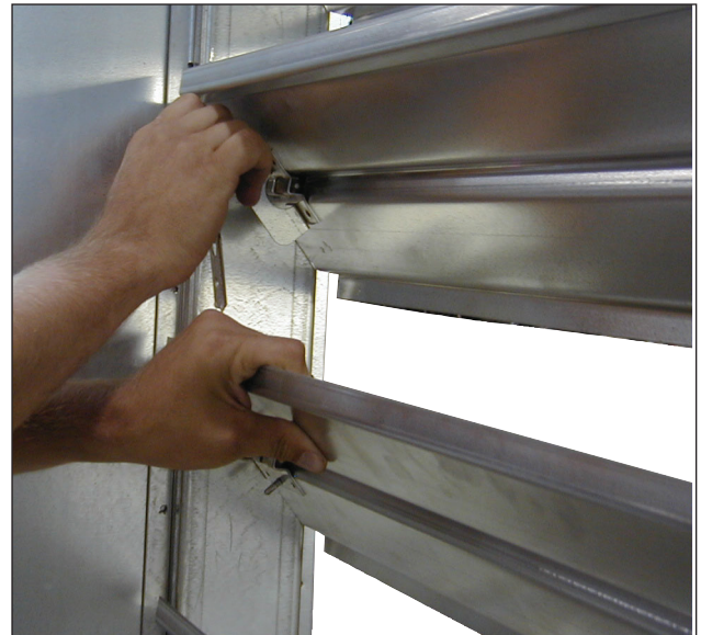
6. Open blades up fully.