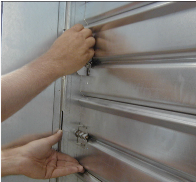
5. Push in lever and grab blade bracket to open blades up.