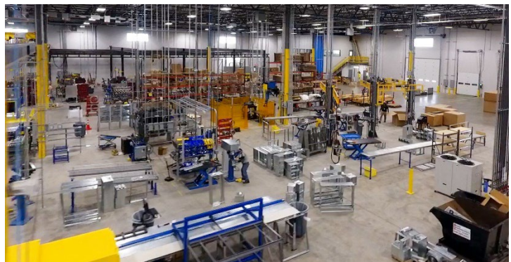
Damper facility, Tulsa, OK