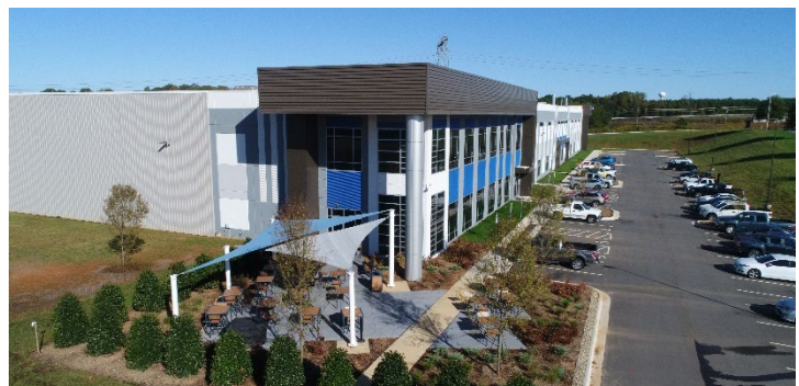
Damper facility, Shelby, NC