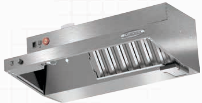
Fire Ready Residential Range Hood Model GRRS