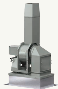
FumeJet® with Curb Cap and Inlet Box