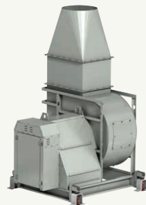
Vektor®-CH Free Inlet Installation