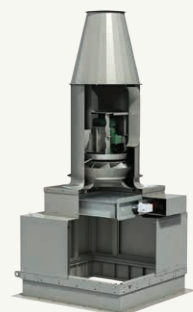
Vektor®-MH shown with Inlet Box, Curb and Isolation Damper