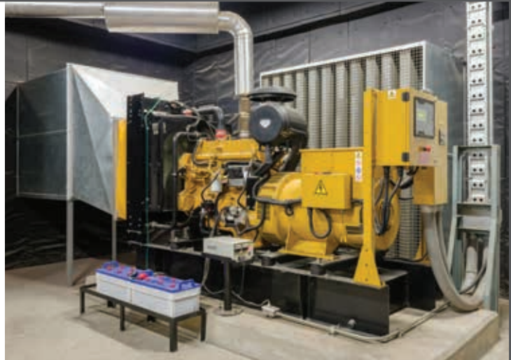
Diesel generators are used for emergency power. They are typically interiorly mounted and located on the lowest floor of the building.

Electric power supply is critical for life safety in a variety of applications. Universities may require the supply of backup power to maintain normal operation for the safety of students, staff, and faculty. Hospitals require emergency power supply to treat patients for the duration of power outages. Data centers are vital in today's world and rely on power for uninterrupted operation. For these critical applications, facility engineers often rely on diesel generators for emergency power generation.