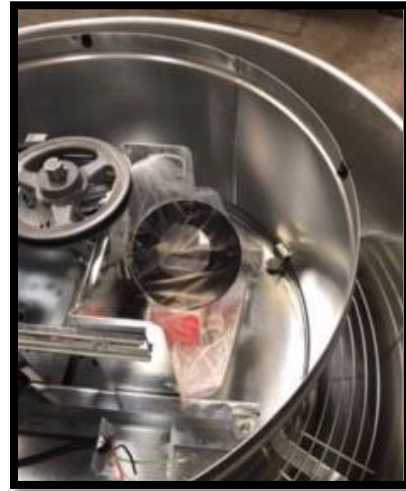
Field-applied foam curb seal located in motor compartment