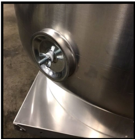
Factory-installed Clean-Out Port

A field-installed Clean-Out Port is now a selectable accessory on CUE/CUBE fans. This kit provides an easy way to field install a Clean-Out Port. This kit includes a mounting plate, gasketed plug, caulk for sealing, and necessary fasteners. Some tools are required for install – see Installation, Operation and Maintenance Manual for details. The factory-installed Clean-Out Port will continue to be available for selection.