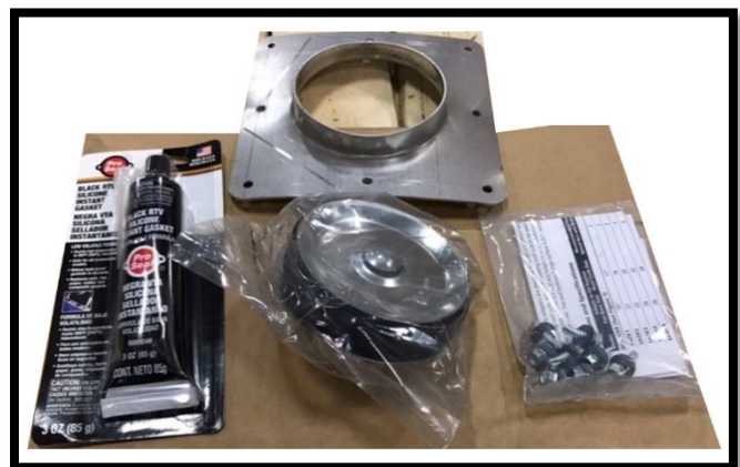
Field-installed Clean-Out Port kit